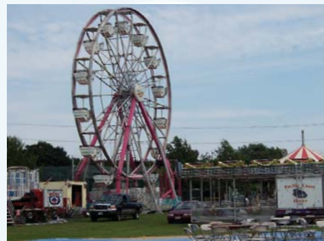
The annual Heritage Festival is held every summer at Pierce Field.

New playground equipment was installed at the Agawam Recreation Area, Lyle Bourne Park and Martello Street Playground. New shelters were erected at Providence Avenue and Sabin Point Parks. The Department planted and maintained 11 large planters throughout the City as well as the 15 planters along Taunton Ave. It also monitored construction during the rehabilitation at both Glenlyon Park in Rumford and the Rose Garden behind the Martin School.