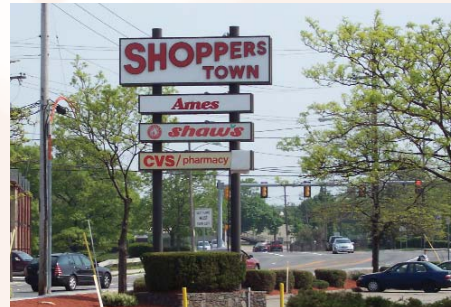
A new 70,000 square foot Shaw’s Supermarket will be built at the Shopperstown Plaza.

Master Plan approval was granted for the Taunton Avenue Shopperstown Plaza redevelopment to allow for the construction of a new 70,000 square foot Shaw’s Supermarket. The existing