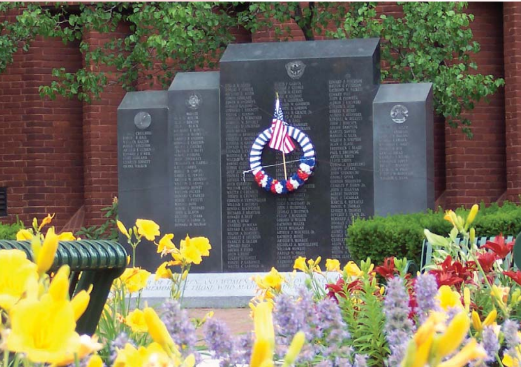
The grounds of the City Hall building on Taunton Avenue features a memorial to honor the many veterans who have fought for our country's freedom.

The Human Services Department provided Thanksgiving baskets, food certificates and other services for local families in need and provided toys and clothing for Christmas. The Emergency Homeless Shelter continued to operate on a night-to-night basis, providing a warm place to sleep with two meals per day for residents who are temporarily removed from their home or for those who are homeless.