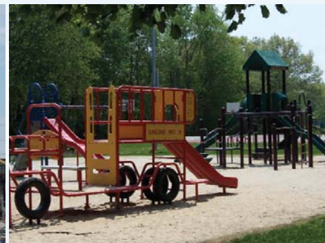
New equipment was installed at playgrounds throughout the City.

Police officers responded to 53,989 calls for service (CFS) in 2006. Officers investigated 5,469 criminal complaints, arrested 2,728 individuals; investigated 2,265 motor vehicle accidents, issued 12,045 motor vehicle violations and 1,269 parking violations. This is the second consecutive year we have experienced a decrease in the number of accidents. In 2005 we had reduced the number of accidents by 124 (4.85%) and in 2006 we reduced the number by 155,