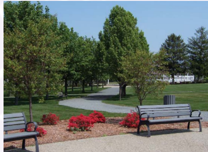
The Rose Larisa Memorial Park is located in the Riverside section of the City and is a favorite spot for relaxation and recreation.

The Department implemented the conversion from a fully self-insured workers compensation program to a system integrated with the RI Department of Labor & Training and Beacon Mutual Insurance Co. The Department implemented a health reimbursement