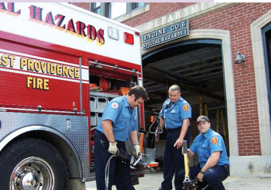
The East Providence Fire Department is the most highly trained Hazardous Materials Response Team in the state.

The Department provided fire protection services through five Engine Companies (each staffed with 1 Officer and 2 Firefighters) and two Ladder Companies (each staffed with 1 Officer and 1 Firefighter). A Battalion Chief supervised all on-duty personnel and served as the Incident Commander for all multi-company responses.