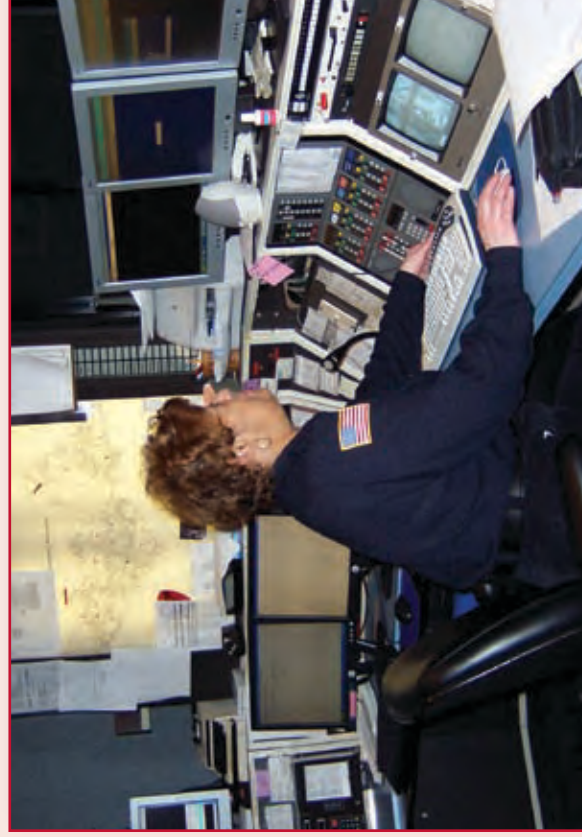
The Police Department headquarters facility on Waterman Avenue features a Dispatch Room where, in 2007, nearly 55,000 calls for services were dispatched.

The Detective Division is presently staffed from 8:00 AM-4:00 PM and 3:00 PM-11:00 PM. The addition of the night detectives has cut costs in call backs, increased coordination and cooperation in multi-jurisdictional investigations, provided for an immediate response in the evening hours to felony crimes, provided alternative times that are convenient for victims and witnesses to meet with detectives, and added additional units on patrol in the evening hours.