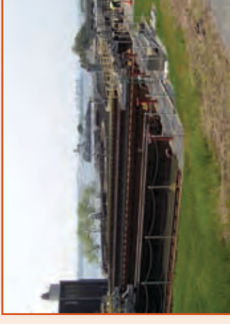
An average of 93.3% of all organic pollutants that entered the City's Water Pollution Control Facility in Riverside were removed prior to discharge into the Providence River. In 2007, 1,054.41 wet tons of dewatered biosolids were processed and trucked to the Central Landfill in Johnston.

Water quality continues to be a main focus with a goal to provide high quality water to residents at an affordable price. In 2007 there were days when some customers experienced temporarily discolored water. Those incidents are primarily the result of efforts to improve our network of water mains through construction and the flushing program. The Division continues to sample and test the City water on a regular basis, far exceeding the minimum amount required by the Rhode Island Department of Health. In 2007 more than 2,500 samples were taken to ensure a safe product, and the Division remains in compliance with the regulatory requirements.