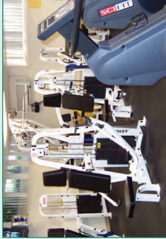
The fitness room at the Center is designed to meet the exercise needs of East Providence senior citizens.

The Senior Center fitness room is designed to meet the exercise needs of our senior citizens. The goal of the program is to increase seniors' awareness and knowledge of the benefits of exercise and provide an atmosphere solely for older adults. This program also promotes attitude change and development of appropriate exercise skills. It ultimately will reduce the health risks of a sedentary lifestyle and improve the quality of life for our senior population.