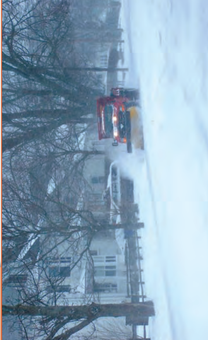
In 2007, Highway Division crews went out 2 times to plow and 5 times to perform sanding operations. Over the winter season, 1,438 tons of salt and 1,600 gallons of Ice-Be-Gone was used.

Residents disposed of 16,733 tons of household rubbish, 673 tons less than in '06, at a cost of $524,694, a reduction of $32,300 from '06, and recycled 4,278 tons of residential materials at no disposal cost.