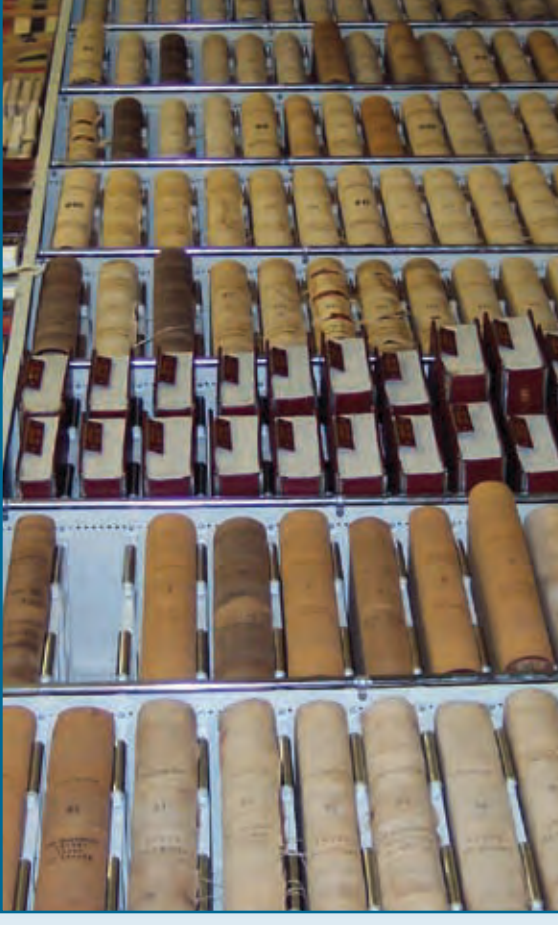
The City Clerk's Office is responsible for the custody and protection of all public records, which includes all land evidence, births, deaths, and marriages of City residents. The records in the City Clerk's office date back to 1862 when East Providence became a town in Rhode Island.

Births totaled 521; deaths totaled 605; marriage licenses recorded in this office totaled 417; and marriage licenses issued from this office totaled 245.