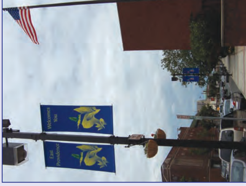
The Planning Department provides staff assistance to the Downtown Business Association, a non-profit organization dedicated to the visual and economic revitalization of Taunton Avenue.

The Planning Department provides staff assistance to several boards and commissions including the Planning Board, Conservation Commission, Historic Properties Commission, Economic Development, Beautification, Harbor Management, and Waterfront Special Development District Commissions. Staff assistance was also provided to the Downtown Business Association of East Providence, a 501(c)(3) non-profit dedicated to the visual and economic revitalization of Taunton Avenue.