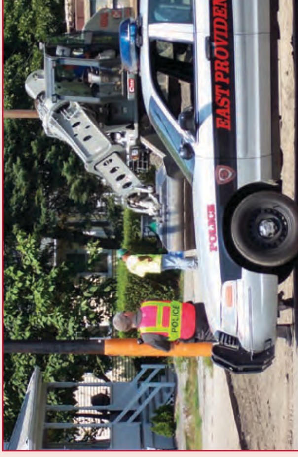
Police officers work closely with the City's Engineering and Highway Departments to provide traffic control for street and sidewalk repair projects.

In the past twelve months, East Providence police officers responded to 54,746 calls for service. Officers investigated 5,162 criminal complaints, arrested 2,500 individuals, investigated 1,986 motor vehicle accidents, issued 1,638 R.I. Traffic Tribunal violations, 4,787 Municipal Court violations, 63 Loud Music violations, 1,116 Parking violations, 893 District Court Summons and 3,708 Defective Equipment violations. In the past twelve-month period, the Department was able to reduce the number of motor vehicle accidents by 279 which represents a 12.3% reduction. Since 2005, the Department has reduced the number of accidents for three consecutive years for a total of 22%. Police officers will continue to be vigilant in traffic enforcement to continue the reduction of accidents to make this a safer community to commute through.