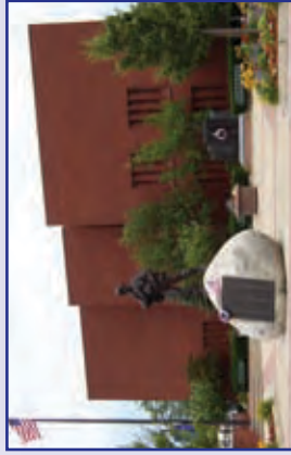
City Hall, as seen from Purchase Street

The City saw several major companies expanding operations in the City of East Providence in 2007. Icus Inc., an East Providence company for many years, announced plans to construct a new 90,000