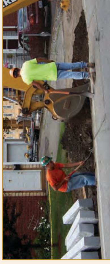
The Highway Division of the Public Works Department used 213 yards of concrete in 2007 to repair or replace sidewalks and storm drain structures throughout the City.

The Division repaired over 588 potholes throughout the City. In addition to pothole patching, Division personnel repaired utility trenches (water, sewer, storm drain, etc.) using 953 tons of hot mix asphalt. Approximately 213 yards of concrete was used to repair or replace sidewalks and storm drain structures throughout the City for various reasons.