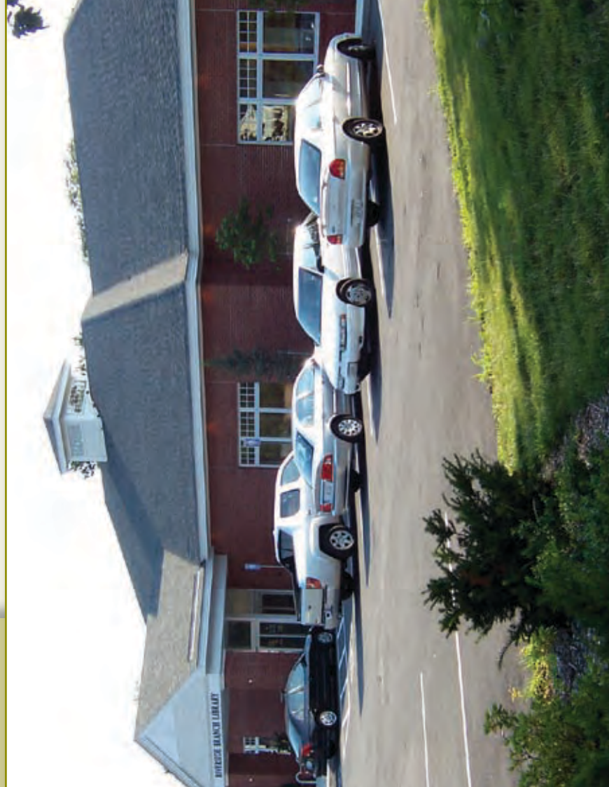
The Riverside Branch Library is located on Bullocks Point Avenue and features a Community Room available for library programs and meeting space for local organizations.

All Libraries contain a circulating collection of books, magazines, videos, books on tape/CD, music CDs and DVDs. Also, downloadable books are available. Free access to the Internet is offered at all locations along with programs for adults and children, literacy classes, computer instruction, reference help, homework help, and superior customer service.