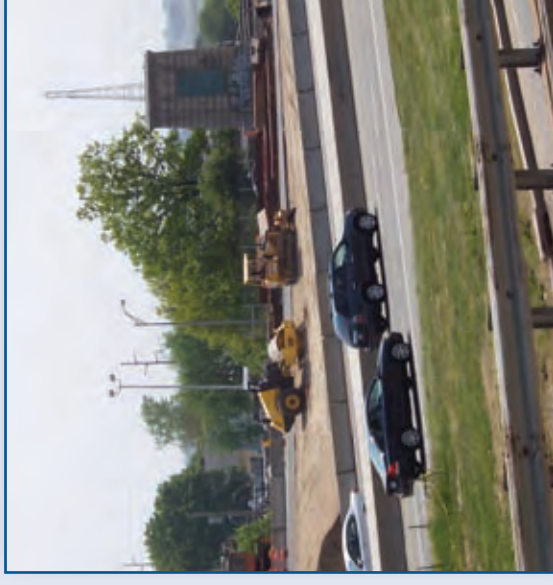
Final design for new ramps to and from Interstate 195 in the vicinity of Taunton Avenue and Warren Avenue was underway in 2007.