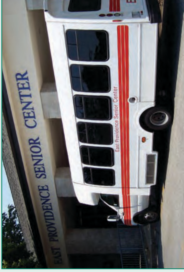
The Senior Center provides convenient door-to-door transportation to seniors to encourage their participation in activities and programs at the Center.

Planning for the future has been on our minds for quite some time. Planning the expansion of the main building began several years ago and continues to be one of our top priorities. As our seniors change and their expectations become greater, we must adjust to accommodate their ever-changing needs.