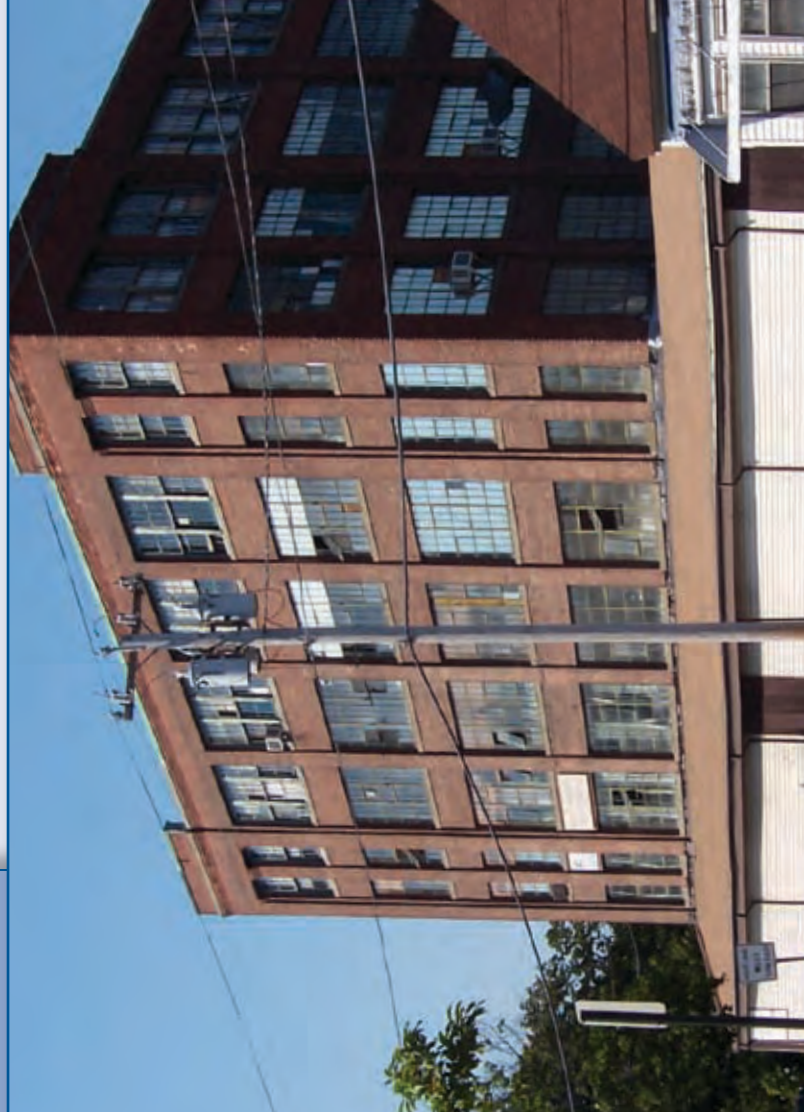
Final planning approval for the redevelopment of the historic Rumford Chemical Works property was granted in 2007.

The Department reviewed 25 subdivisions (both new and continued from previous years) including Land Development Projects and Development Plan Review projects. Major Land Development Projects include the 321-unit Wampanoag Ponds development on Wampanoag Trail, which received Master Plan approval from the Planning Board and zoning map amendment from the City Council. Final approval was also granted to the Rumford Center, a mixed-use redevelopment of the historic Rumford Chemical Works property; construction of which is now underway. New Zoning regulations banning electronic, LED signs, and certain other signage were proposed by the Department and enacted into law by the City Council.