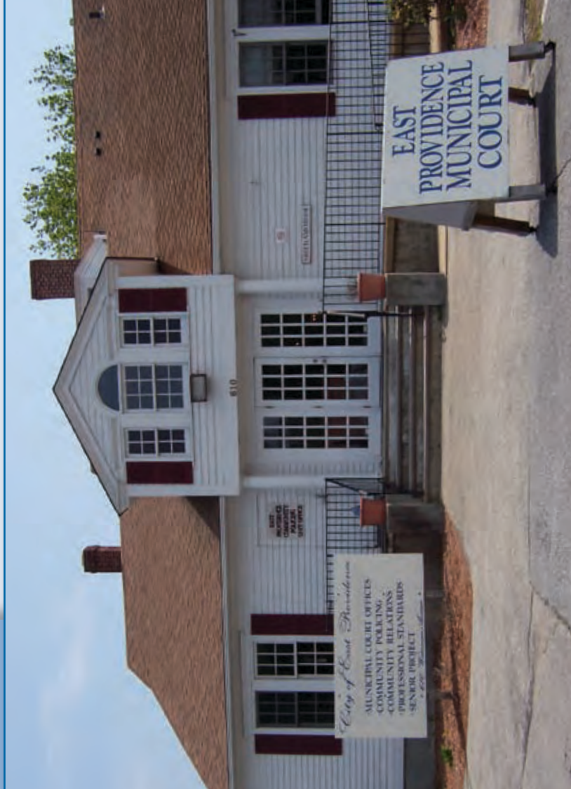
East Providence Municipal Court is located at the Senior Center complex at Pawtucket and Waterman Avenues.

The Municipal Court, along with the Police Department, will become a learning site for the new E-ticket program sponsored by the state.