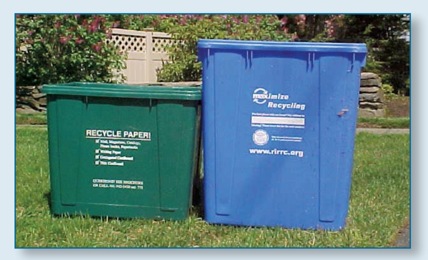
Recycling Containers: Recycling is mandatory for all households per City Ordinance.

The WPC Division inspected over 24,200 feet of sewer lines utilizing the mobile TV inspection vehicle exposing leaks and blockages designated for repair. A new river crossing pipe, manhole and 350 feet gravity sewer line was installed.