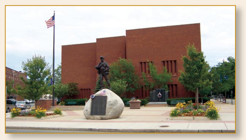
City Hall Plaza, Taunton Avenue: Civil War Veterans Memorial (foreground) and Veteran's Memorial for All Wars (rear) remember East Providence's fallen heroes.

East Providence was 1 of 14 communities chosen in RI to receive the Strategic Prevention Framework State Incentive Grant, based on need. After a 6-month needs assessment, the EPPC was approved by the state to implement the 188 page plan to reduce underage drinking in East Providence by focusing on reducing youth access to alcohol. The EPPC developed the "Townies Putting the Brakes on Underage Drinking Campaign" which includes the following components: educating alcohol retailers, community organizers and the EP community about state laws, local ordinances and policies pertaining to youth alcohol access; increased enforcement through compliance checks, party patrols and a potential tip-line; working with decision-makers to reduce youth access through local ordinances and tightening up local policies.