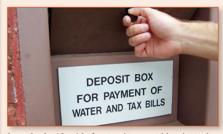
Payment Drop Box: A Deposit Box for water and tax payments is located next to the Grove Avenue entrance to City Hall.

The Purchasing Division also takes advantage of cooperative bidding, wherever favorable, through participation in several local and national buying cooperatives, including the National Association of State Purchasing Officials, the Western States