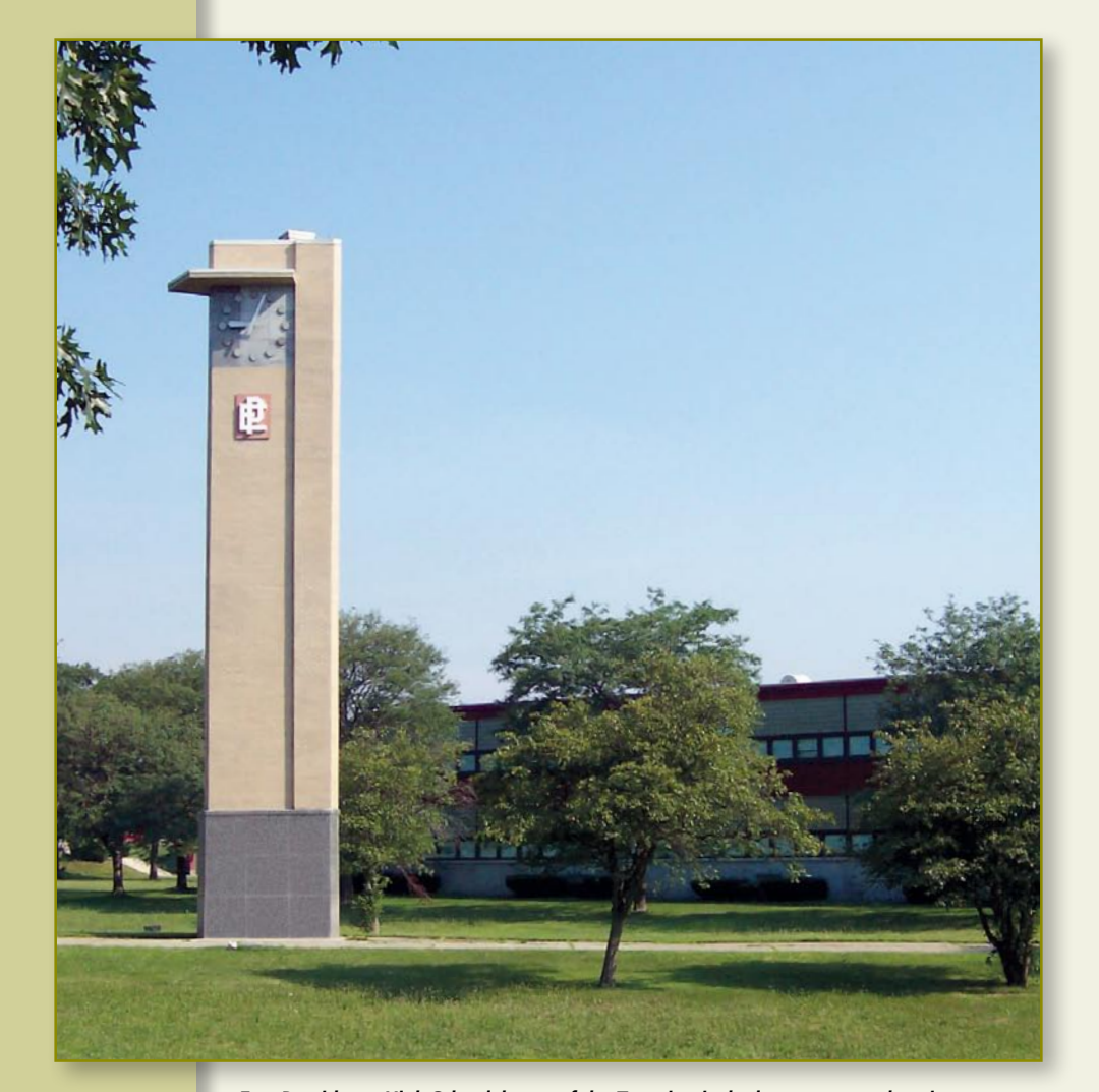
East Providence High School, home of the Townies, is the largest comprehensive high school in Rhode Island.

The department also provides educational planning and services for about 1,000 non-public school students and a wide range of health and educational programs for pre-school children as young as three and as old as twenty-one years of age.