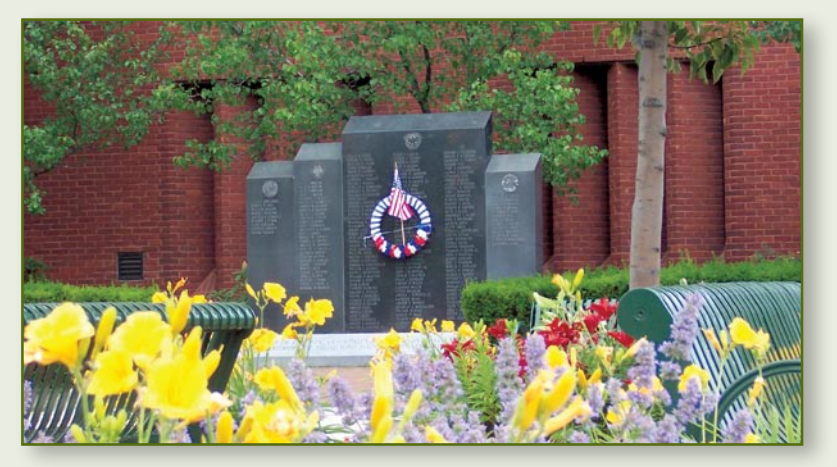
A plaque at Veteran's Memorial at City Hall Plaza honors all veterans of all wars.

Law Department attorneys also serve as counsel for the Police Department for criminal and juvenile prosecutions and for the prosecution of code violations in the Municipal Court which include zoning and housing violations, boating violations, and other miscellaneous ordinance violations. In 2008, this included the prosecution of 48 code violations, the processing of 52 claims and the acceptance of service and preparation of pleadings for 16 new lawsuits filed against or on behalf of the City.