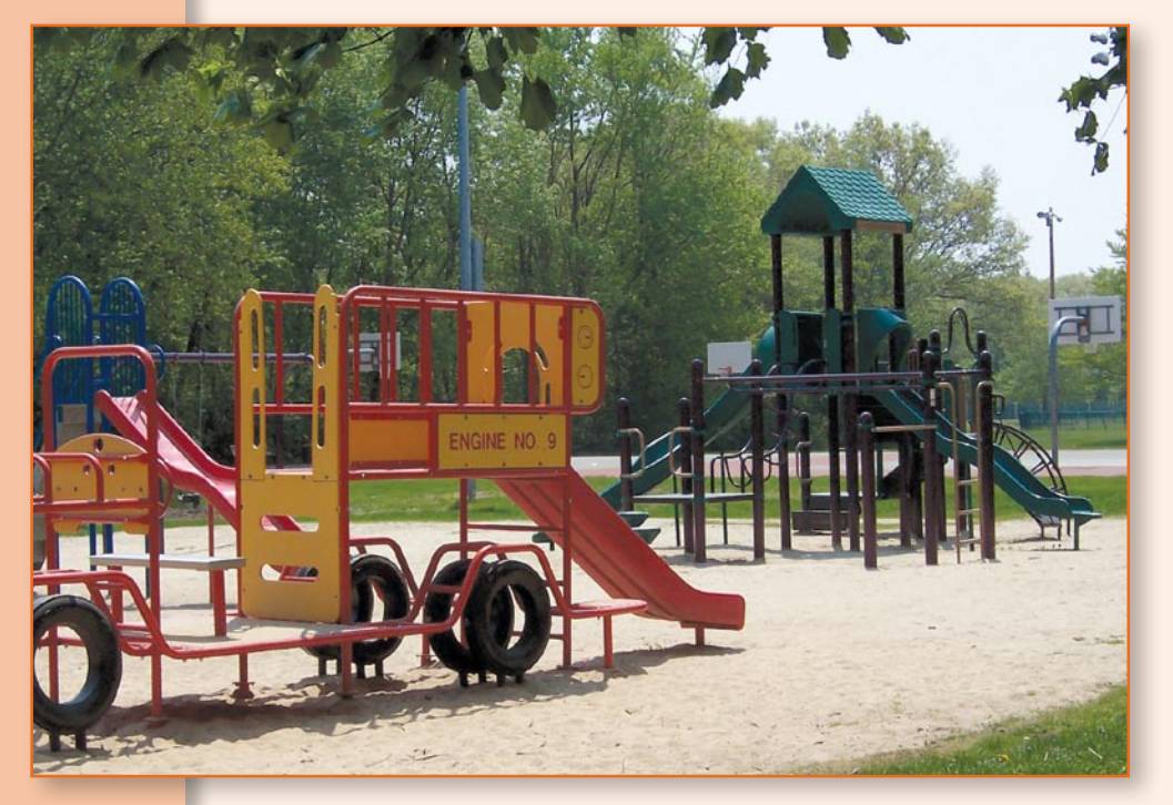
Playground equipment at Agawam Park, Pawtucket Avenue.

Department-sponsored activities are housed at the East Providence Recreation Center located at 100 Bullocks Point Avenue. Activities at the Center were conducted from September through May, with weight and exercise facilities open six days a week during the summer. The Recreation Center plays host to many special events including a wide variety of activities, performances, and tournaments. The department also runs the summer playground program for City youth ages 6-15 from late June to mid-August.