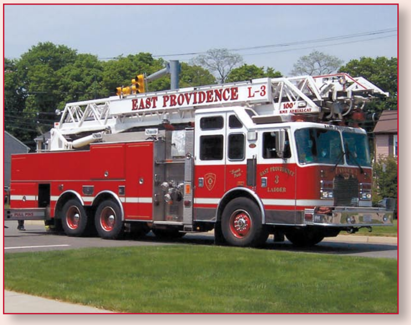
Aerial Ladder Truck L-3 is part of the firefighting fleet at Fire Station #3 on North Broadway.

The Department's Division of Training & Safety provides and oversees departmentwide training in all aspects of today's fire service. It also evaluates all safety issues throughout the department. The division oversees the operation of the City's Emergency Operations Center, which has emergency communications radios, emergency dispatching computers and other monitoring devices to direct any and all City-wide emergency. This division also is responsible for all data entry into all of the Department's computer systems and programs.