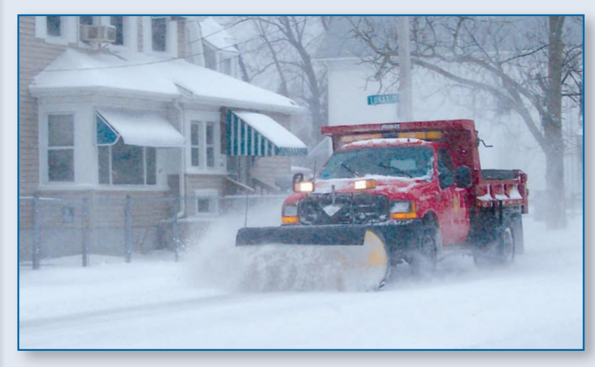
Winter Work: Snow plow operations on Bullocks Point Avenue.

Another mild winter season required crews to plow only 4 times and perform sanding operations only 9 times using approximately 1,900 tons of salt on roadways, public buildings, and City and school parking areas.