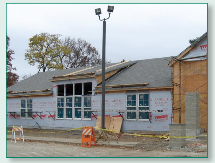
Senior Center Expansion: The addition will house a library, computer lab, multipurpose room, and much-needed fitness center.

Development for the future has been on our minds for quite some time. Planning the expansion of the main building began several years ago and construction is now upon us. As our membership changes and their expectations become greater, we must adjust to accommodate their ever changing needs.