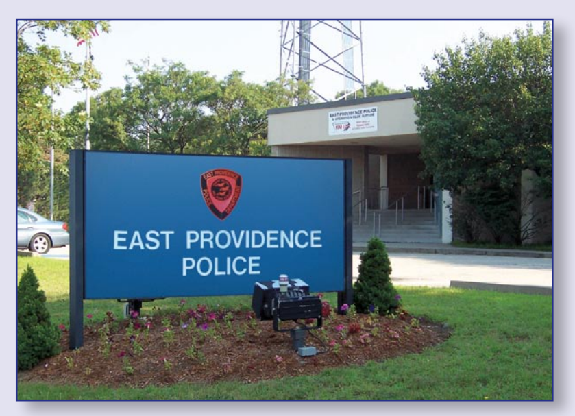
The East Providence Police Station is located at 750 Waterman Avenue.

The Community Policing Unit (CPU) continued its efforts to improve the quality of life in our neighborhoods and its "neighborhood crime watch" programs. The CPU continued its partnership with the State of R.I. Probation Department by sharing information and resources as well as assisting in monitoring probationers who reside in the City. The Safe Haven Program/Domestic Violence Follow-up Program is working out well. The Domestic Violence Program acts as a liaison with the Domestic Violence Advocate and the victims of domestic violence as well as following up on certain active cases.