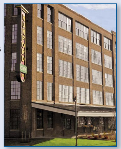
The renovated Rumford Center – a mixed-use redevelopment of residential and commercial units.

The City continued its status as a state-designated Enterprise Zone. The program has attracted a number of participants to East Providence with tax benefits associated with job growth.