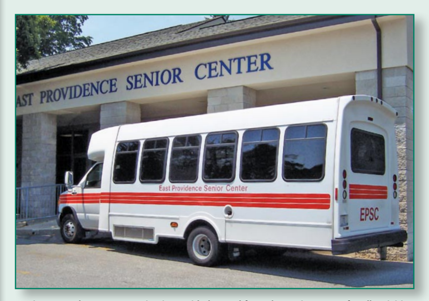
Senior Center bus transportation is provided to and from the Senior Center for all activities.

The senior center fitness room is designed to meet the exercise needs of our seasoned citizens. The goal of the program is to increase seniors' awareness and knowledge of the benefits of exercise and provide an atmosphere solely for older adults. Participation in the fitness center helps to reduce the health risks of a sedentary lifestyle and improves the quality of life for our senior population.