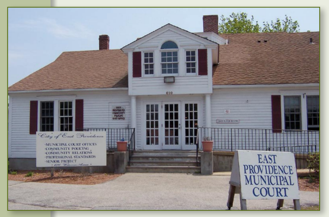
Municipal Court Offices are located at 610 Waterman Avenue in the Senior Center Complex.

The East Providence Municipal Court is comprised of a Municipal Court judge, administrator, bailiff and two court clerks that provide daily operations of the Municipal Court. Various cases heard in Municipal Court are housing, city ordinances, boating, animal and traffic violations. During this past fiscal year, the Municipal Court has processed over 6,000 cases; seventy percent of these cases have been adjudicated.