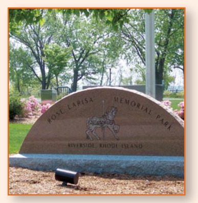
is host to concerts and various activities during the summer.

Development Block Grant funds, the Parks Division installed new playground shelters at Agawam, Kent Heights, Rose Garden and completed the Lyle Bourne Park project. The division planted and maintained 11 large planters throughout the city, 23 smaller planters along Taunton and Warren Avenues, as well as the hanging flower pots surrounding City Hall. Parks performed much of the site preparation to begin the Sabin Point Park rehabilitation project and again winterized all City irrigation systems in-house. Entrance to Rose Larisa Park: The park For the sixteenth straight year, the City has received the Tree City USA designation from the National Arbor Day Foundation.